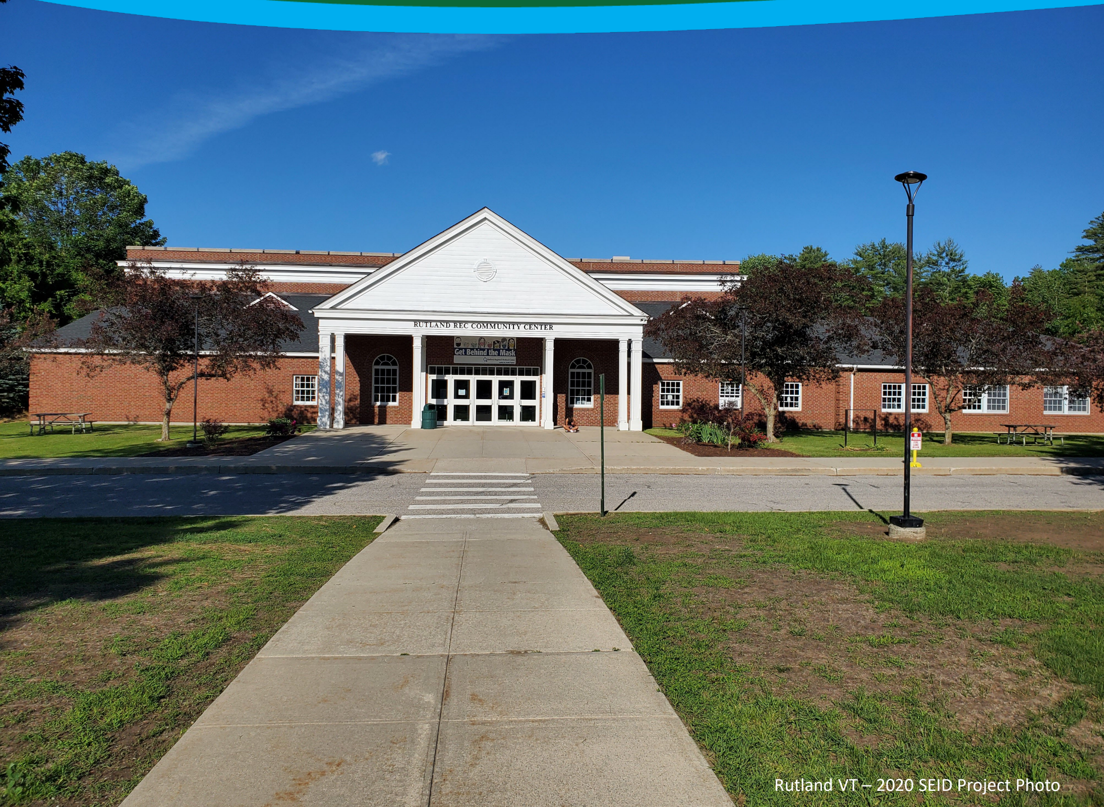
Rutland VT – 2020 SEID Project Photo