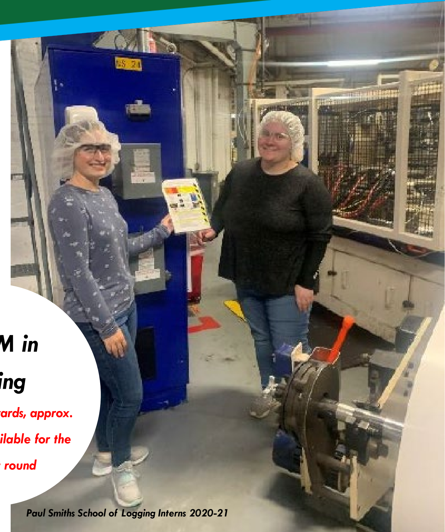
Paul Smiths School of Logging Interns 2020-21

After spring awards, approx. $4.4MM is available for the fall grant round